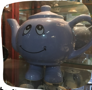
the first teapot!